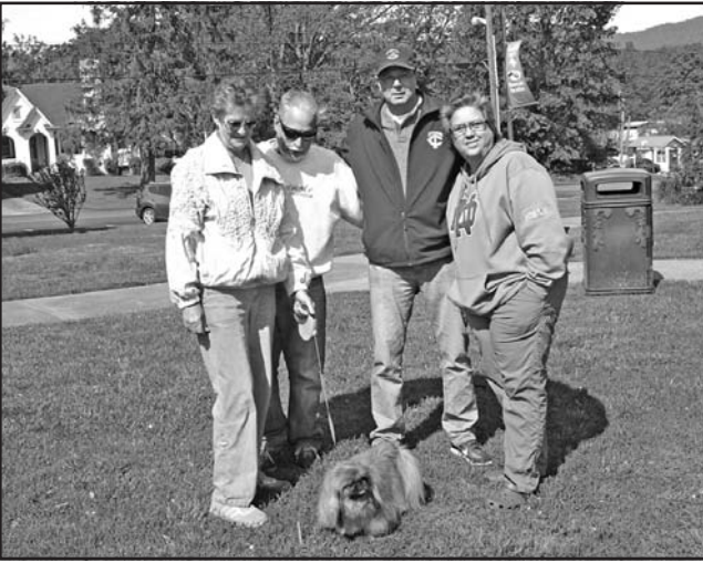
The Wildfire Preparedness event was truly a community experience.

"These wildfires that happened so close to home last fall, I think they really alerted people to how dangerous wildfires can be."